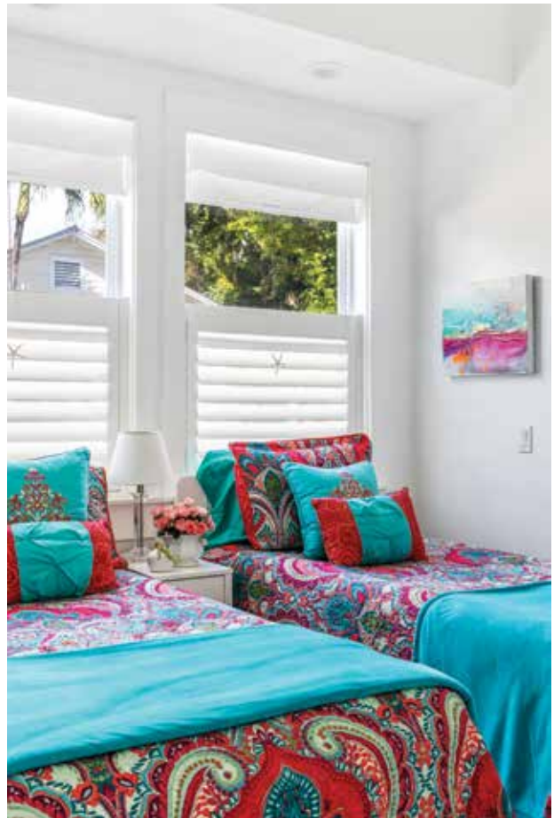
A cheerful bedroom at the front of the house continues the colorful theme.