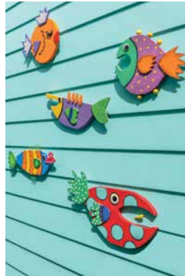
Colorful fish adorn the poolside of the house.