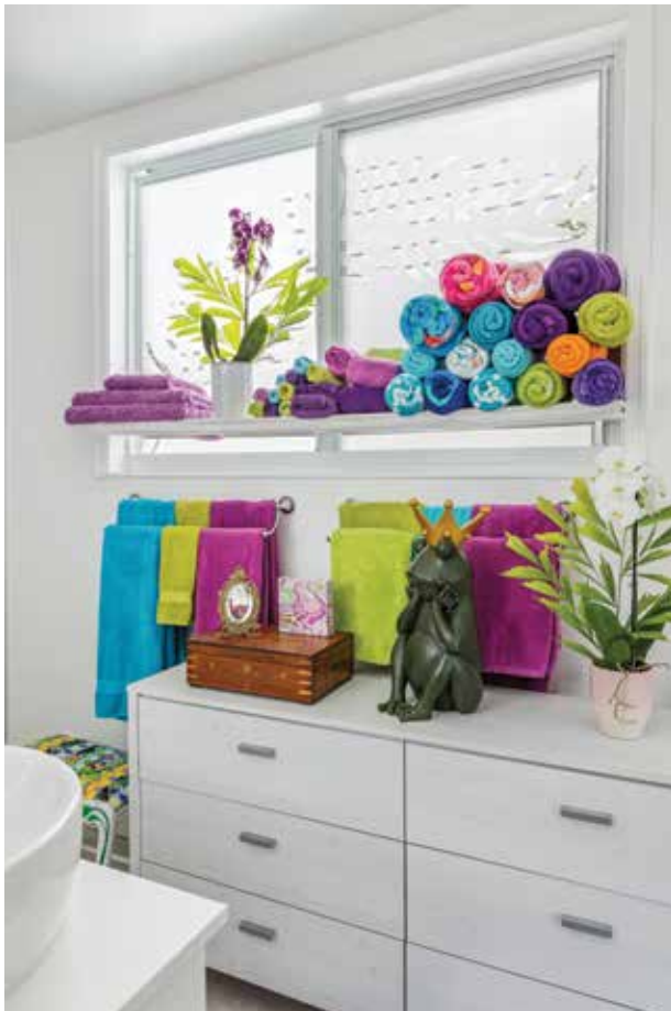
Even the bathroom continues the colorful theme, started before you even enter the house.